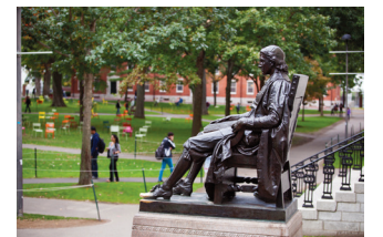
John Harvard Statue

(10) The Old Yard is the oldest part of Harvard's campus, with first references to its existence appearing in 1639. Now, most of the structures within the Old Yard are first-year dorms. University Hall now houses the offices of the Deans of the Faculty of Arts and Sciences, including the Dean of Harvard College. (11) The John Harvard Statue faces (12) Johnston Gate , the main entrance to the Old Yard. The College was founded by the Massachusetts Bay Colony in 1636 and named "New College." A local clergyman, John Harvard, bequeathed half of his estate and entire library, and the "New College" was renamed in his honor.