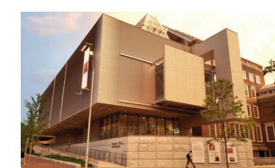
Harvard Art Museums

(4) Oxford Street and Divinity Avenue hold several major laboratories, academic departments, and museums, including the Peabody Museum of Archaeology and Ethnology and the Harvard University Herbaria .