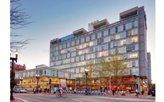
Richard A. and Susan F. Smith Campus Center

(15) The Richard A. and Susan F. Smith Campus Center is dedicated to enhancing student life. It contains space for study and gatherings, in addition to the Center for Wellness and Health Promotion. Numerous restaurants and cafes and the Harvard Visitor Center are open to the public.